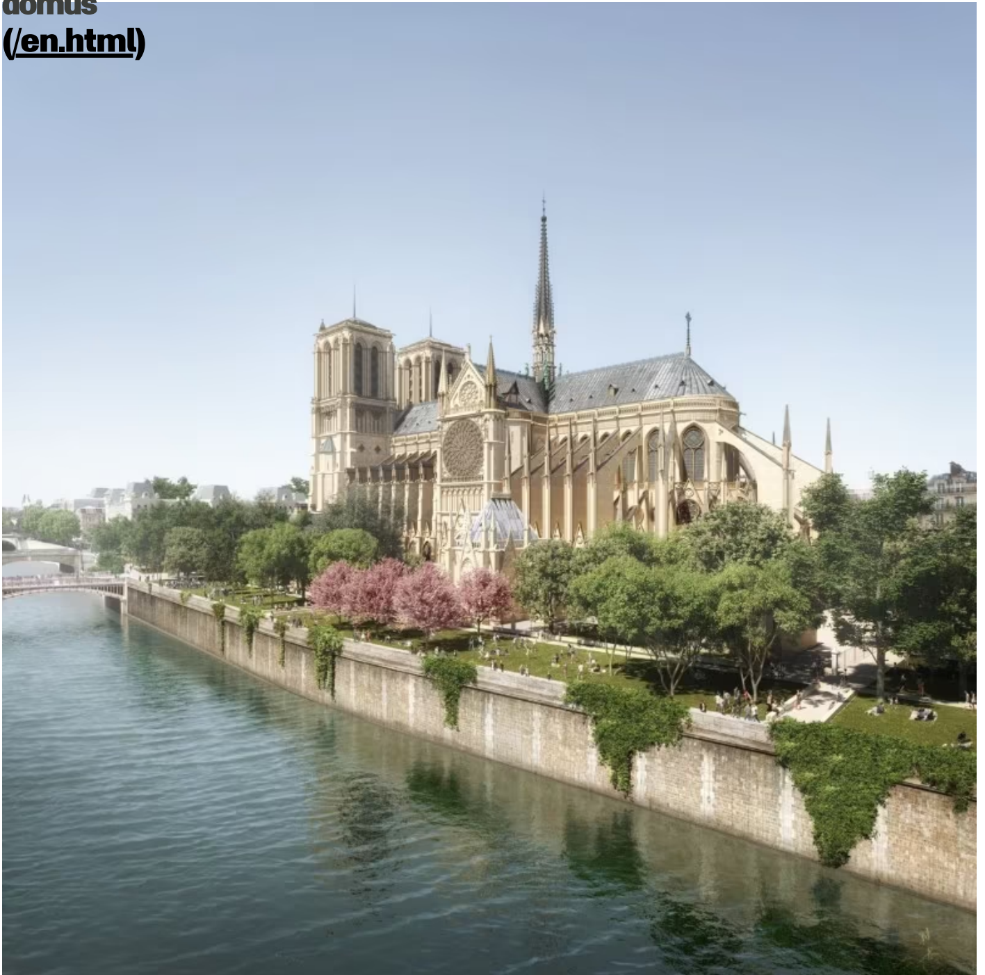
Bureau Bas Smets, GRAU e Neufville-Gayet, Parvis Notre-Dame, Paris, France.

“For 800 years, Notre-Dame has been a privileged witness to the city’s transformation. Rethinking its surroundings means first of all questioning what public spaces are needed for the city of tomorrow,” explains landscape architect Bas Smets. “Urban figures such as squares, plazas, alignments and banks are all present around the Cathedral, but in a fragmented way. The design reveals the quality of each place and rethinks each of these figures from the dual perspective of the collective and the climate”.